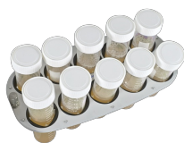
PRS-10 BS-010117-IK platform

5 tubes 20-30 mm diameter (50 ml tubes) and 12 tubes 10-16 mm diameter (1.5-15 ml tubes).