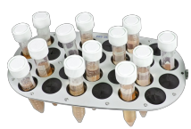
PRS-26 BS-010117-GK platform

Can accommodate 26 tubes 10-16 mm diameter (1.5-15 ml).