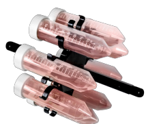
M-8/50 BS-010117-PK platform

10 tubes 25-30 mm diameter (50 ml tubes).