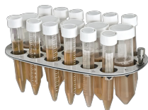
PRS-5/12 BS-010117-HK platform

Can accommodate 26 tubes 10-16 mm diameter (1.5-15 ml).