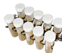
PRSC-10 BS-010117-LK platform

Can accommodate 22 tubes 16 mm diameter (15 ml).