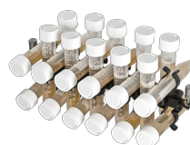
PRSC-22 BS-010117-LK platform

10 tubes 20-30 mm diameter (up to 50 ml tubes).