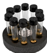
SV-10/10 BS-010210-BK platform

16/8/8 sockets for 1.5/0.5/0.2 ml microtest tubes (Ø 11/8/6 mm).