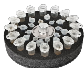
SV-16/8 BS-010210-CK platform

16/8/8 sockets for 1.5/0.5/0.2 ml microtest tubes (Ø 11/8/6 mm).