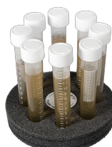
SV-8/15 BS-010210-DK platform