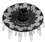
R-0.5/0.2 BS-010205-BK rotor

Rotor for 12 x 0.5 ml and 12 x 0.2 ml microtest tubes