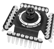
SR-32 BS-010205-FK rotor

Rotor for 2 x 8-section 0.2 ml microtube strips