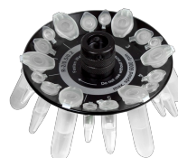
R-2/0.5/0.2 BS-010205-DK rotor

Rotor for 8 x 2/1.5 ml and 8 x 0.5 ml microtest tubes