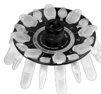
R-2/0.5 BS-010205-CK rotor

Rotor for 8 x 2/1.5 ml and 8 x 0.5 ml microtest tubes