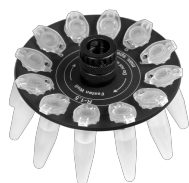
R-1.5 BS-010205-AK rotor

Rotor for 12 x 0.5 ml and 12 x 0.2 ml microtest tubes