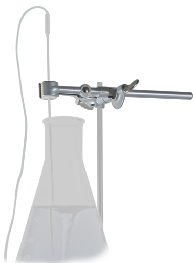
HTP-1 BS-010309-FK holder