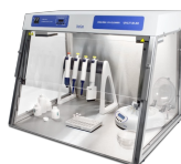
UVC/T-M-AR BS-040104-AAA DNA/RNA UV-cleaner box

DNA/RNA UV-cleaner box UVC/T-M-AR is designed for clean operations with DNA samples. UV-cleaner box provide protection against contamination.