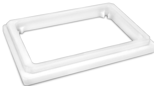
AP-384 BS-010219-EK adapter

2 adapters for 96-well semi-skirted and non-skirted PCR plates - made of Ertacetal® C. Autoclavable