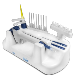
HAS-1 BS-040118-PK Hand operator set