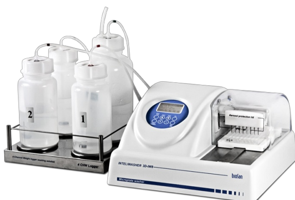
3D-IW8 BS-060102-AAI Inteliwasher