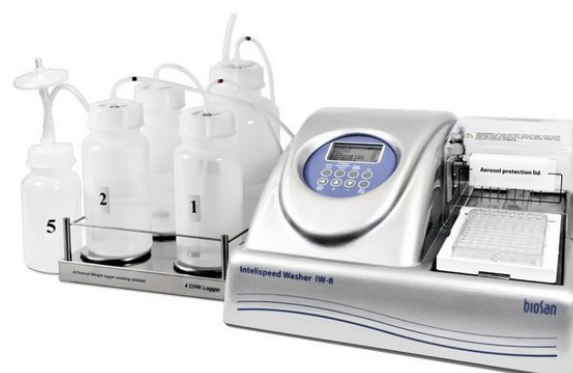
IW-8 BS-060106-AAI Intelspeed washer