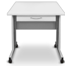
T-4 BS-040101-BK Table

New modular design of laboratory furniture provides flexibility and ease of use.