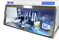
UVT-S-AR BS-040107-AAA DNA/RNA UV-cleaner box

DNA/RNA UV-cleaner box UVT-S-AR is designed for clean operations with DNA samples. UV-cleaner box provide protection against contamination.