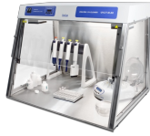
UVC/T-M-AR BS-040104-AAA DNA/RNA UV-cleaner box

DNA/RNA UV-cleaner box UVC/T-M-AR is designed for clean operations with DNA samples. UV-cleaner box provide protection against contamination.