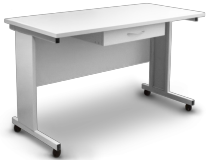
T-4L BS-040107-BK Table

New modular design of laboratory furniture provides flexibility and ease of use.