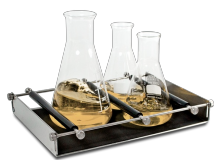
UP-12 BS-010108-AK platform