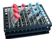
P-16/88 BS-010116-BK platform

Platform with spring holders for up to 88 tubes up to 30 mm diameter (e. g. 10 ml, 15 ml, 50 ml tubes).