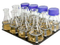
P-12/100 BS-010108-EK platform