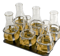
P-6/250 BS-010108-DK platform