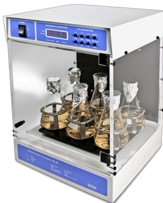
ES-20 Without platform Orbital Shaker-Incubator

The ES-20 is a compact bench-top Shaker-Incubator used for mixing of biological liquids as well as for incubation and cultivation of biological liquids according to the operator set program