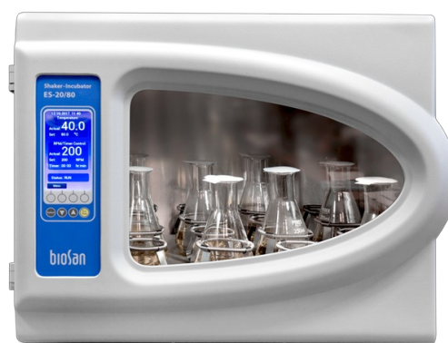
ES-20/80 Without platform Orbital Shaker-Incubator

Universal platform with clamps can accommodate flasks or bottles of different volume sizes. Clamps are not included with platform and need to be ordered separately.