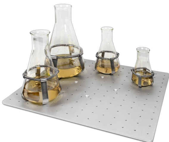
UP-168 BS-010135-JK platform

Universal platform with clamps can accommodate flasks or bottles of different volume sizes. Clamps are not included with platform and need to be ordered separately.