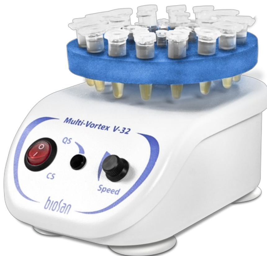
V-32 Including two platforms PV-32, PL-1 Multi-Vortex

Multi-Vortex V-32 is intended for intensive stirring of bacterial and yeast cell, washing from the culture medium and extraction of metabolites and enzymes from cells and cell cultures.