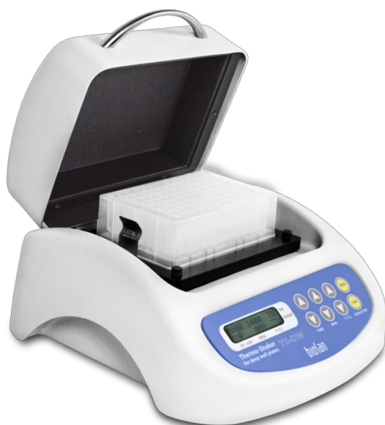
TS-DW Without thermoblock Thermo-Shaker for Deep Well Plates

TS-DW Thermo-Shaker is designed for shaking and incubating deep well plates.