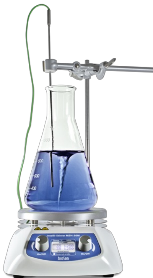
Intelli-Stirrer MSH-300i BS-010309-AAA Magnetic Stirrer with hot plate