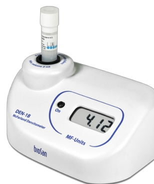
DEN-1B BS-050104-AAF Densitometer (suspension turbidity detector)

Densitometer is designed for measurement of cell suspension's turbidity in the range of 0.0–6.0 McFarland units ( 0 – 180 \times 10^7 cells/ml).