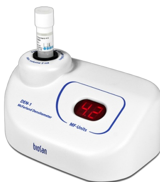
DEN-1 BS-050102-AAF Densitometer (suspension turbidity detector)

Densitometer is designed for measurement of cell suspension's turbidity in the range of 0.3–5.0 McFarland units ( 100 \times 10^6 – 150 \times 10^7 cells/ml).