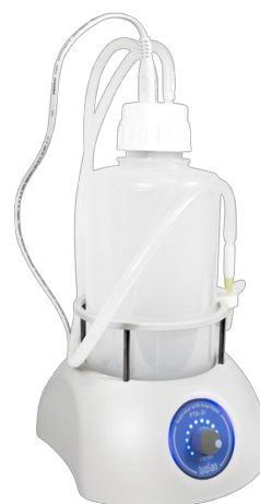
FTA-2i BS-040120-A02 Aspirator with Trap Flask

Aspirator with trap flask FTA-2i is designed for aspiration or removal of alcohol, buffer and liquid from reaction vessels (e.g. during DNA/RNA purification or other macromolecule reprecipitation techniques).