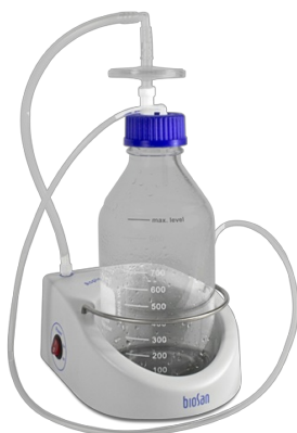
FTA-1 BS-040108-AAG Aspirator with trap flask

Aspirator with trap flask FTA-1 is designed for aspiration/removal of alcohol/buffer remaining quantities from microtest tube walls during DNA/RNA purification and other macromolecule reprecipitation techniques.