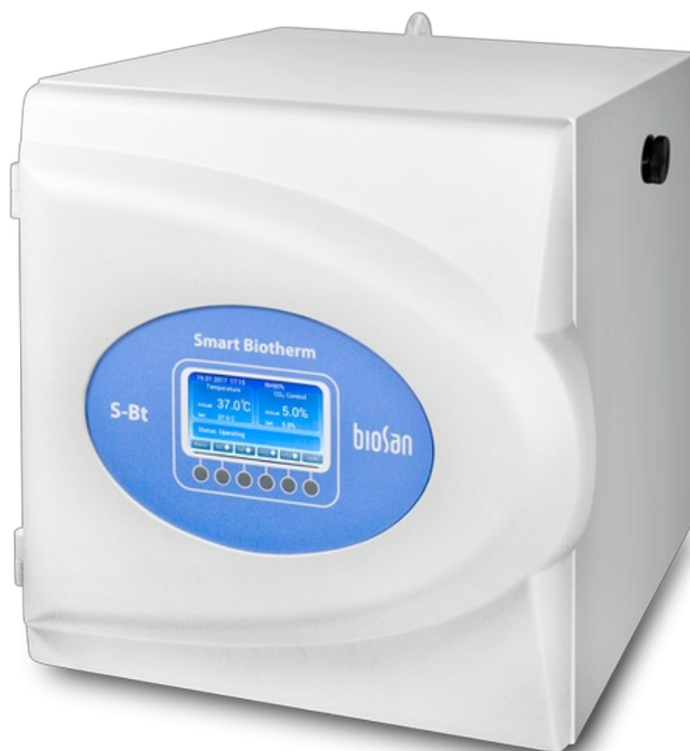
S-Bt Smart Biotherm BS-010425-A01 Compact CO2 Incubator