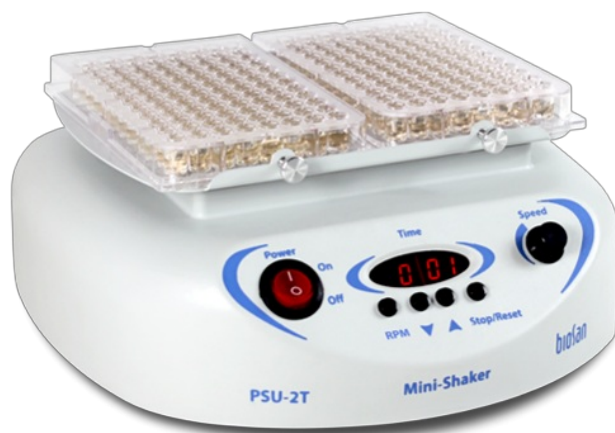
PSU-2T Including IPP-2 platform Mini-shaker for immunology

Mini-Shaker PSU-2T is designed for immunoassays and provides adjustable mixing of reagents in microplates. The device ensures smooth